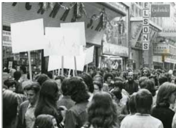
01. Le Blanc envahit la ville , action urbaine en marge de la 12 ème Biennale de Sao Paulo, 1973. Une photo Noir et Blanc, tirage argentique sur papier, 18 x 12 cm © Fred Forest © Adagp, Paris 2017 Document déposé à l'Ina (fonds Fred Forest)