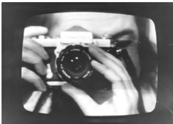
03. La photo du téléspectateur , vidéo performance réalisée par Fred Forest dans le cadre de l'émission Vidéographie sur la Radio Télévision Belge le 13 novembre 1976. Une photo Noir et Blanc, tirage argentique sur papier, 18 x 12,5 cm © Fred Forest © Adagp, Paris 2017