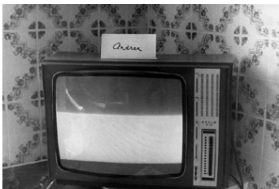
04. La famille vidéo , installation vidéo dans un appartement de Cologne, 1976. Une photo Noir et Blanc, 18 x 12,5 cm © Fred Forest © Adagp, Paris 2017