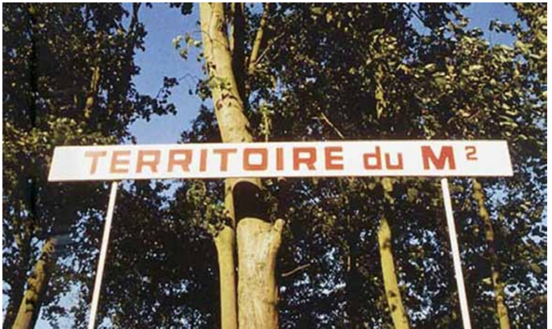
Territoire du Mètre carré (Anserville), œuvre-dispositif-jeu de communication et de simulation, projet évolutif depuis les années 1980. Une photo couleur sur papier de la propriété Le Territoire du M 2, 13 x 9 cm