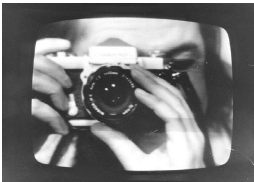
La photo du téléspectateur , vidéo performance réalisée par Fred Forest dans le cadre de l'émission Vidéographie sur la Radio Télévision Belge le 13 novembre 1976. Une photo Noir et Blanc, tirage argentique sur papier, 18 x 12,5 cm

The screen paintings, combining drawn and mechanically reproduced images, were directly followed by the experiments with blanks in newspapers ( Spaces médias , 1972) and then television and radio. Forest’s work can thus be seen as part of the conceptual emancipation from the pictorial that so marked the late 1960s, privileging the “open work”, a notion the artist pushed even further. In his voids or blanks, the work is not just unfinished, but not yet even begun, the creative act being left entirely to the reader, viewer or passer-by. The Spaces médias also represent a reconnection to the tradition of the monochrome, a tribute to the researches of Mondrian and Klein, given a literal reinterpretation in two later works for TV/ video ( Le bleu à la télévision, hommage électronique à Yves Klein , 1984 ; Hommage à Mondrian , 1989). The Territoire du m 2 that stands at the centre of the exhibition furthermore takes up the idea of the grid crucial to Mondrian’s geometric abstraction. The m 2 is both political and artistic in function : a revolutionary standard “for all men and all ages”, it is also the artist’s unit of creation, from TV screen to the metre-square blank canvas.