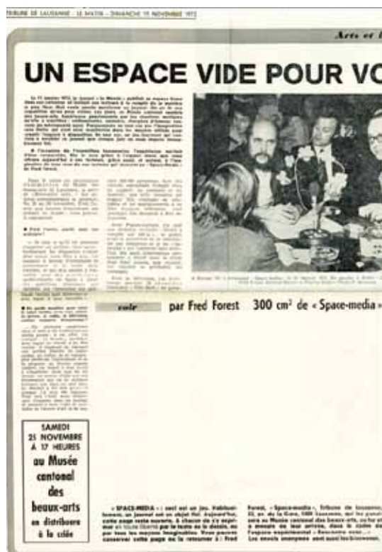
300 cm 2 de “Space-media”, insert dans la Tribune de Lausanne du Dimanche 19 novembre 1972. sur papier, 18 x 12,5 cm © Fred Forest © Adagp, Paris 2017

Fred Forest’s production is always paradoxical: social and symbolical, broadcast and silent, local and global. His voids do not just prompt communication but create interstitial spaces open to the imagination, like his first drawings scribbled in the empty spaces of another medium of communication, the telephone jacks at the post office. An agitator, a man of dialogue and discord, always the infiltrator, he highlights the social force of the media but equally imposes halts on them, moments of “no signal” that turn that forceful flow against itself in making it the vehicle of a discontinuity, a loss, an un-informing that make dreaming possible. Rooted in contemporary sociology, Forest’s project is at the same time creative, halting the flow of the media long enough to make a moment of art or poetry possible. Long enough, for example, to go to the Russian far north and revolutionise science by showing that the Arctic Circle isn’t a circle but a “one metre by one metre” square (1989). Fred Forest’s territory is furthermore plural, combining realist documentary and utopian space: neighbourhood studies alongside major expeditions, political territories (São Paulo, Bulgaria, Slovenia, etc.) conjoined with properly fictional spaces.