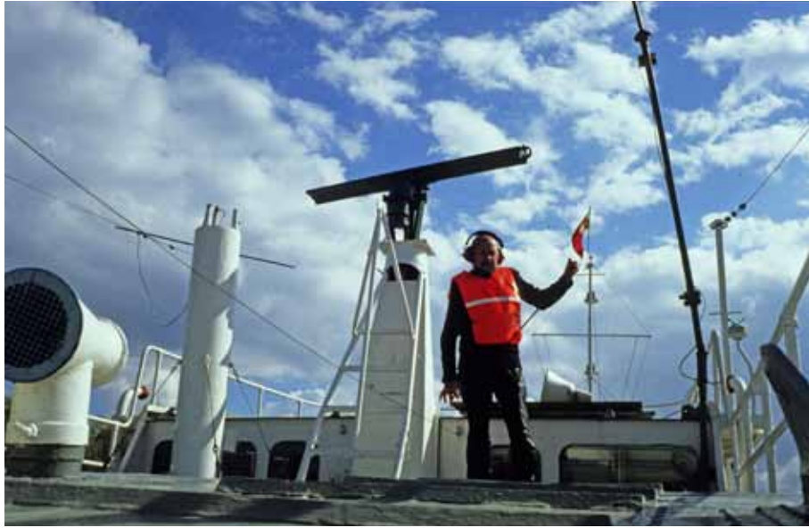
Rituels télématiques pour nuits blanches , action-voyage au Cercle arctique (U.R.S.S) du 4 au 26 août 1989. Une photo couleur sur papier, 14,2 x 9,5 cm © Fred Forest © Adagp, Paris 2017

At the same time, global interventions have proliferated, political and utopian in aim. Such paradoxes of scale are found too in Forest's media actions, which embrace both broadcasting ( Apprenez à regarder votre TV avec votre radio, 1984 ) and written communication (mail art) in a fluid discourse that established him as a pioneer of sociological and communications art.