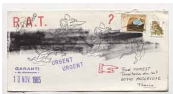
08. Correspondance envoyée à Fred Forest, président du Territoire, œuvre de mail art. Une enveloppe, 14 x 9 cm © Fred Forest © Adagp, Paris 2017 Document déposé à l'Ina (fonds Fred Forest)