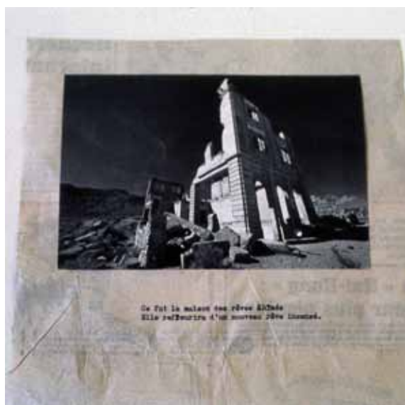
05. La maison de vos rêves , Space-media dans la Tribune de Lausanne du 5 novembre 1978, exposition des réponses au Musée cantonal des Beaux-Arts de Lausanne du 27 novembre au 10 décembre 1978. © Fred Forest © Adagp, Paris 2017