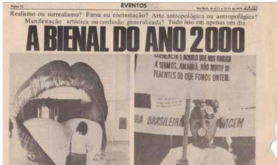
Biennale de l'An 2000 , événement critique socio-culturel, musée d'art contemporain de Sao Paulo en marge de la 13 ème Biennale de Sao Paulo, (Brésil), 1975, extrait de journal la Folha de Sao Paulo , 21 août 1975. © Fred Forest © Adagp, Paris 2017

At the heart of this section is the space devoted to La Bourse de l'imaginaire , installed in the same space in 1982, dedicated to the production of imaginary "news items" and their ranking on a market, a subversive treatment of both art and market in the service of shared utopias.