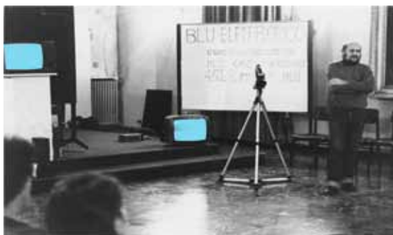
10. Le bleu électronique : Hommage à Yves Klein , performance et installation multimédia, musée de Benevento (Italie), mars-avril 1984. Une photo numérisée retouchée. © Fred Forest © Adagp, Paris 2017