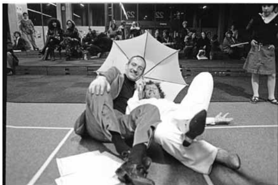
09. Le Territoire du M 2 , œuvre-dispositif évolutif, présentation du Territoire du M 2 à la foire de Bâle off à l'invitation d'Ingo Kummel, 1979. Une photo Noir et Blanc, tirage argentique sur papier, 12 x 9 cm © Fred Forest © Adagp, Paris 2017