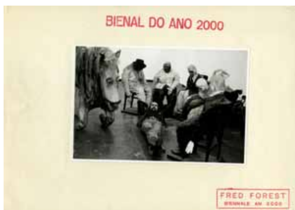
02. Biennale de l'An 2000 , événement critique socio-culturel, musée d'art contemporain de Sao Paulo en marge de la 13 ème Biennale de Sao Paulo, (Brésil), 1975. Une photographie Noir et Blanc d'une installation proposé par le groupe d'artistes participants et Fred Forest. © Fred Forest © Adagp, Paris 2017 Document déposé à l'Ina (fonds Fred Forest)