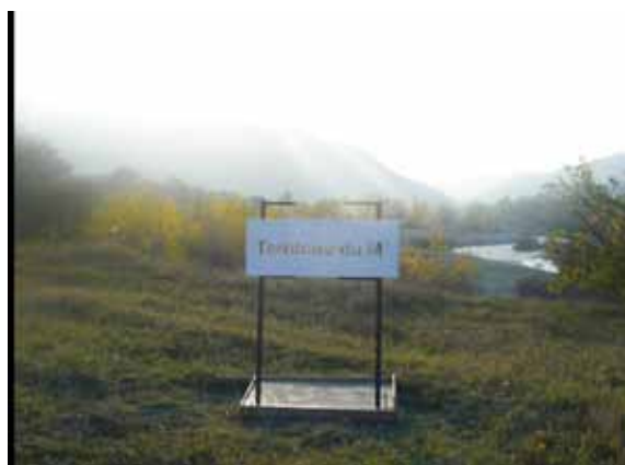
06. Un M² installé dans la campagne géorgienne près de Tbilissi grâce à la complicité de Ferdinand Corte en mémoire de cet artiste et de cet être extraordinaire qu'il a été pour moi © Fred Forest © Adagp, Paris 2017