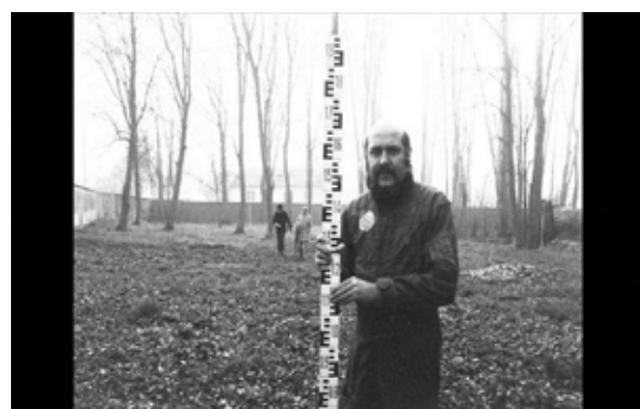
07. Le Territoire du M² , Fred Forest dans sa propriété avec le mètre étalon. Une photo Noir et Blanc, tirage argentique sur papier, 12 x 9 cm © Fred Forest © Adagp, Paris 2017