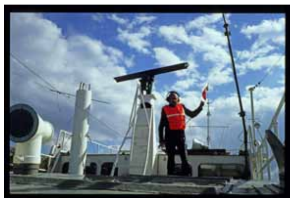
12. Rituels télématiques pour nuits blanches , action-voyage au Cercle arctique (U.R.S.S) du 4 au 26 août 1989. Une photo couleur sur papier, 14,2 x 9,5 cm © Fred Forest © Adagp, Paris 2017